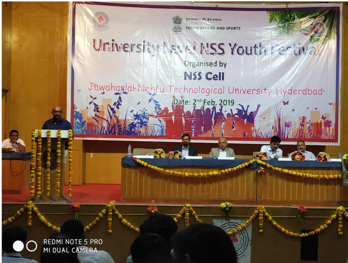
Fig.1 Introduction by JNTUH NSS Program Officer