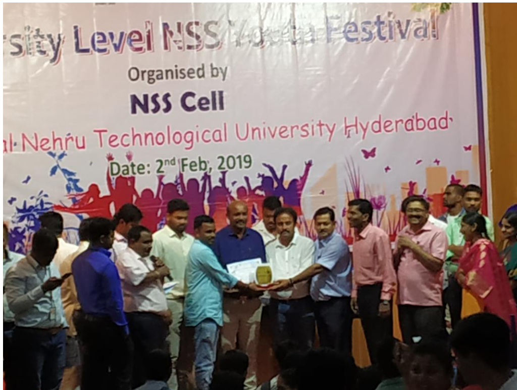
Fig.5 NSS Program Officer Receiving the Participation Certification