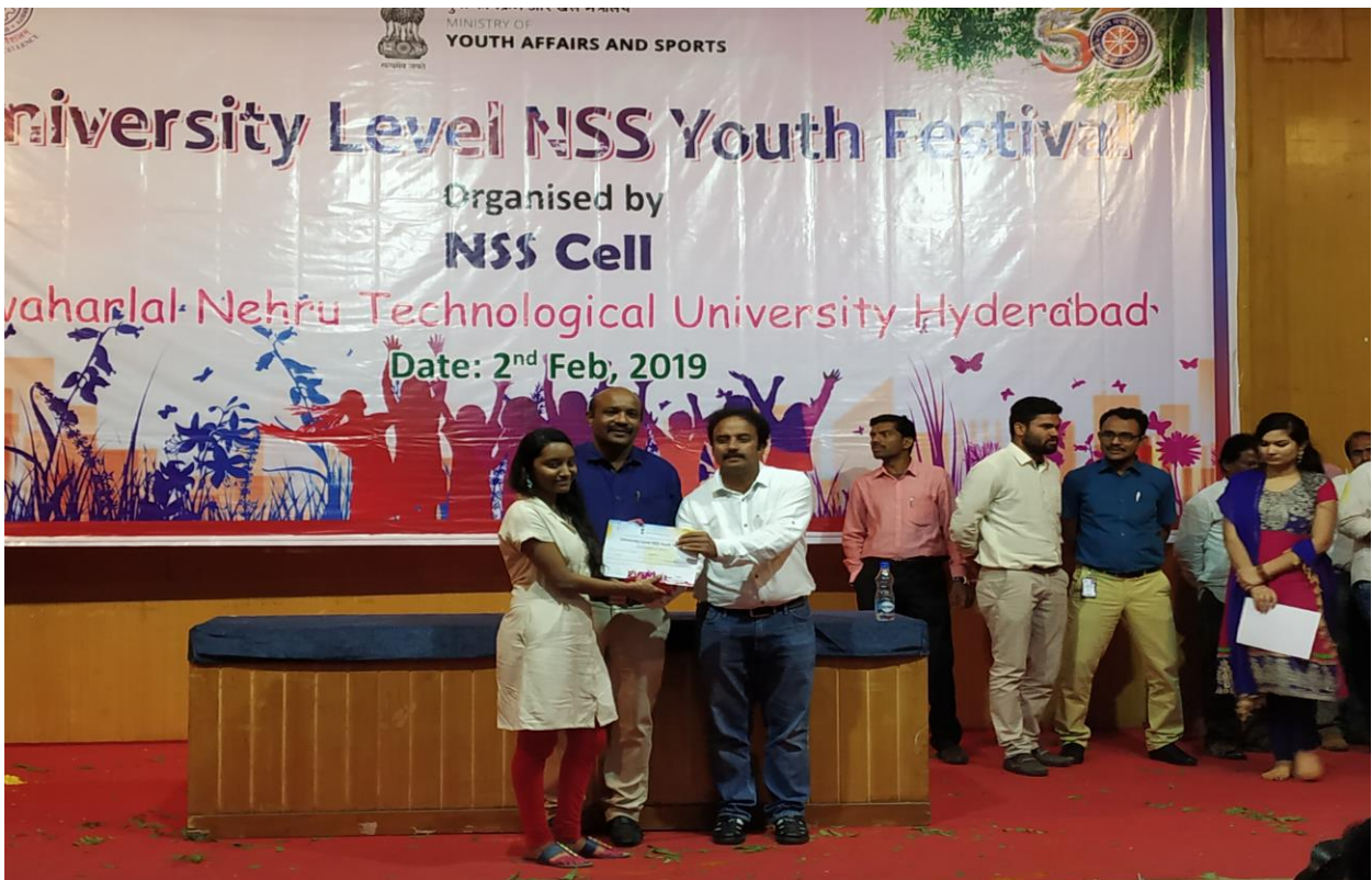
Fig.4 Our Volunteer Receiving the Winner Certificate (Classical Dance)